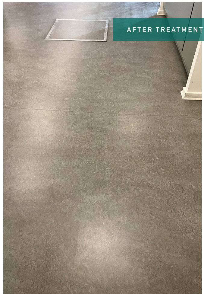
Corridor areas at a municipal heating plant - Treated with PUR Intensive Cleaner, sanded and finished with two coats of PUR Floor Sealer